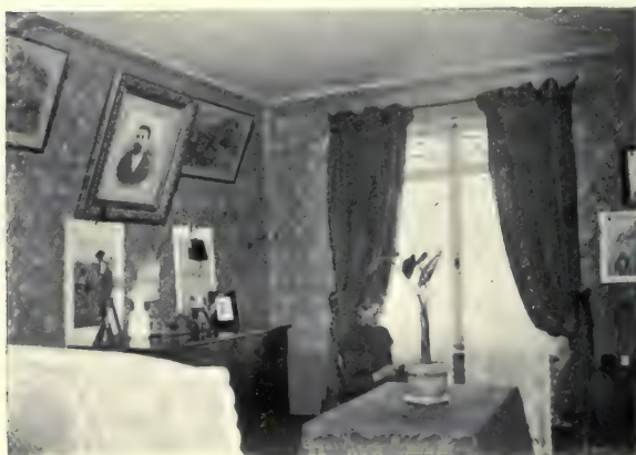
Fig. 9. A BEDROOM.

We see, therefore, that the top-floor rooms are the least desirable. Let us go up, and enter at hazard one of these workmen's dwellings. Figures 8, 9, and 10 show us the home of Mr. and Mrs. L., situated on the west front of the right wing. It includes two large rooms and one smaller one, each has on an average a floor-space of about 216 square feet, and a cubic capacity of a little over 2,000 cubic feet. Besides,